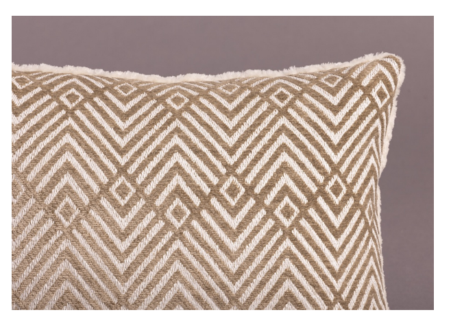
Geometric raffia and chenille